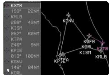
6 The HeliSAS autopilot integrates with the graphic Flight Management System of the Cobham EFIS. Autopilot functionality includes: