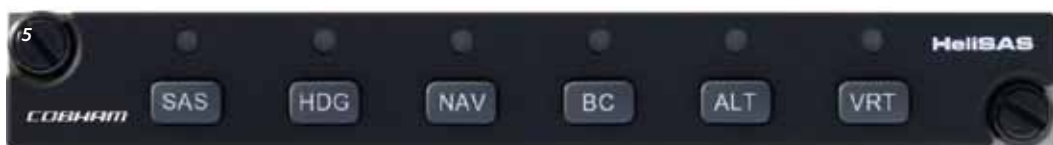
5 The HeliSAS® control panel is pictured here at its actual size of just 5.75" x 0.75". The unit weighs 0.48 pounds. NOTE: All functions can be used in flight at airspeeds above 44 knots.