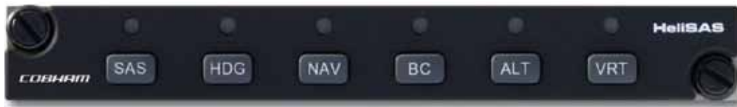
The HeliSAS® control panel is pictured here at its actual size of just 5.75" x 0.75". The unit weighs 0.48 pounds. NOTE: All functions can be used in flight at airspeeds above 44 knots.